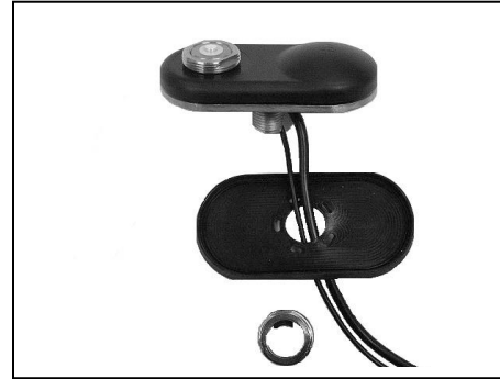
FIGURE 1: PARTS